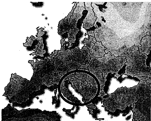
Figure 1: Map of Europe, circle indicating the location of the SFRY. (Map of Europe)

in reference to the former communist SFRY unless otherwise specified (see Figures 1 and 2 below).